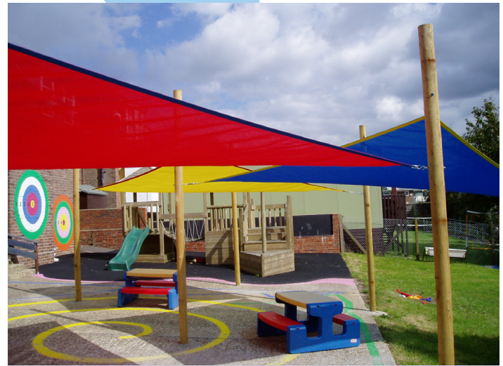
Example of the kind of shade canopy you could win for your school

'My class loved taking part in the SunSmart competition last year, they had fun whilst learning to protect themselves and we now have a brilliant shade canopy in our playground as well'